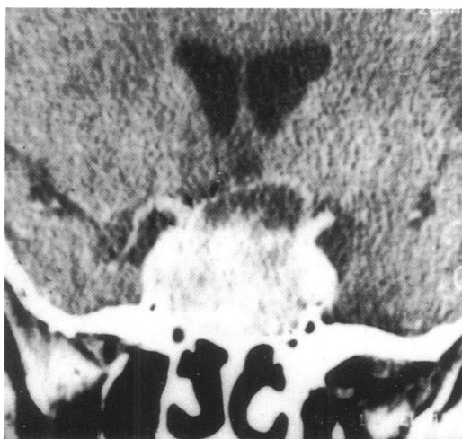
Figure 4 CT scan of patient 10 after 16 months of treatment with headache and visual failure. Coronal section showing the heterogeneous aspect of the tumour corresponding to pituitary necrosis.

Six patients had an initial normal visual function: visual acuity and visual fields were normal in one de novo case (No 6) and five who had undergone surgery (Nos 2, 5, 7, 9, 13). No visual complication was observed under treatment with CV 205-502 with a range of observation from 30 to 43 months. A certain degree of variability in the visual fields was observed; variable and regressive relative scotomas were present without modifications of the prolactin levels, but there was no significant difference between the mean total deficit before and after treatment ( t test).