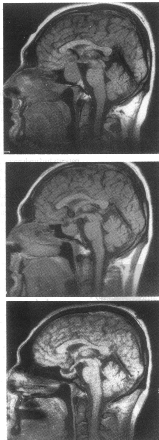
Figure 1 An example of a reduction of more than 50% in the size of the macroadenoma is given in patient 4. On sagittal section MRI (upper) before CV 205-502 treatment; (middle) after 5 months; (lower) after 16 months of treatment.

(Basle, Switzerland) and approved by our institutional ethics committee. Thirteen patients with